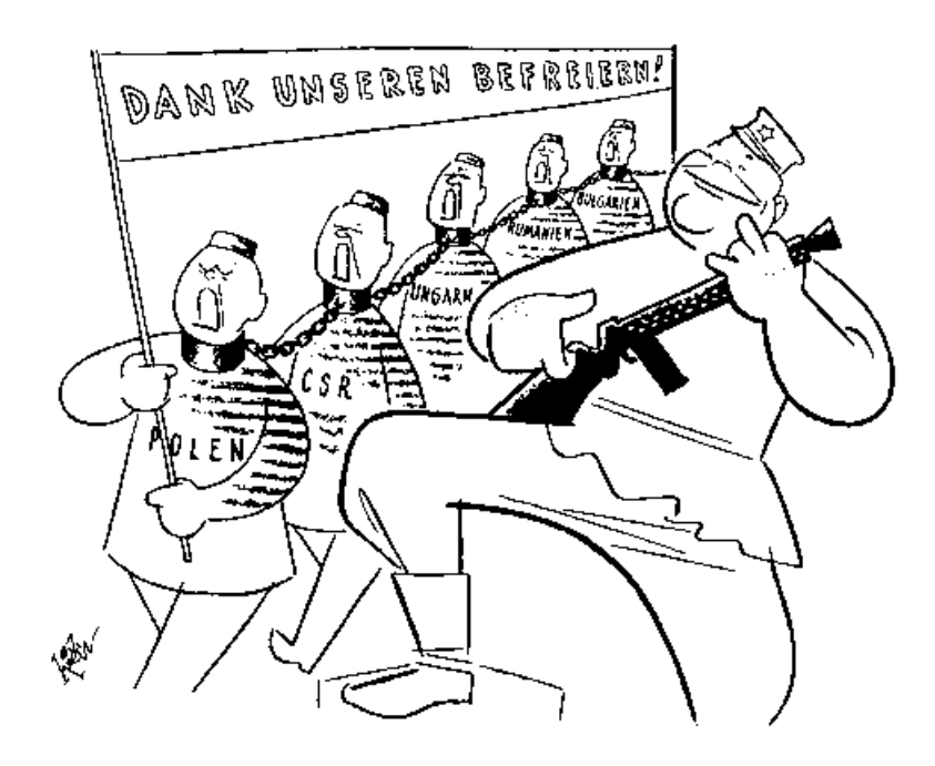
A Western view of the plight of eastern Europe at the end of the Second World War. Poland, Czechoslovakia, Hungary, Romania and Bulgaria carry the banner 'Thank Our Liberators' under the watchful eye of the USSR.

7 Study the cartoon and then answer the questions which follow.