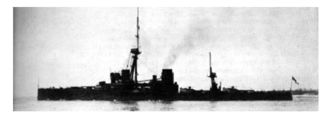
The British battleship HMS Dreadnought launched in 1906.