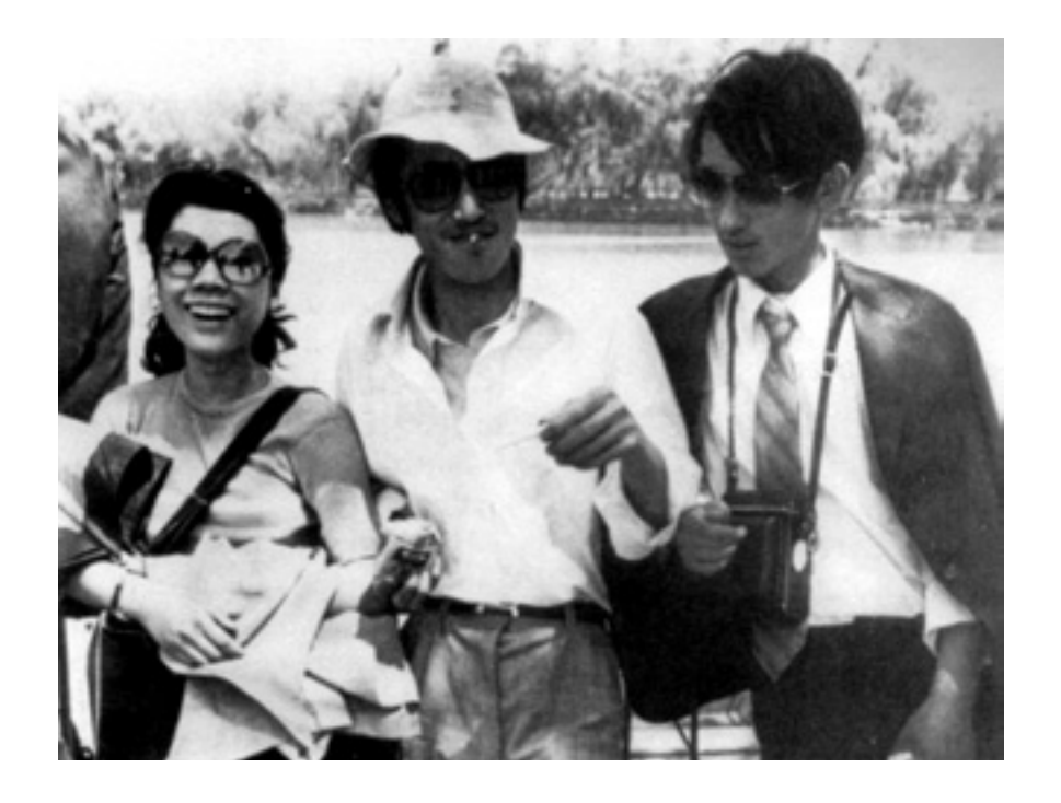
Photograph of young Chinese on the streets of Beijing in the 1980s.