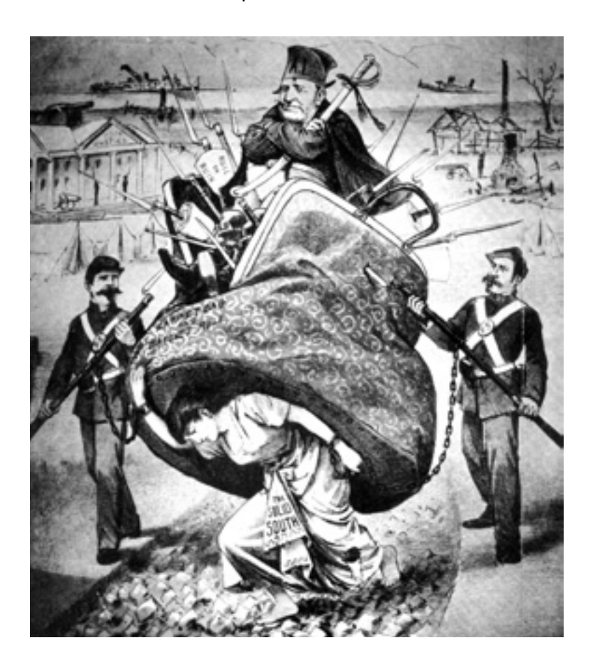
A cartoon of 1880 showing U.S. Grant and carpetbagging oppressing the South