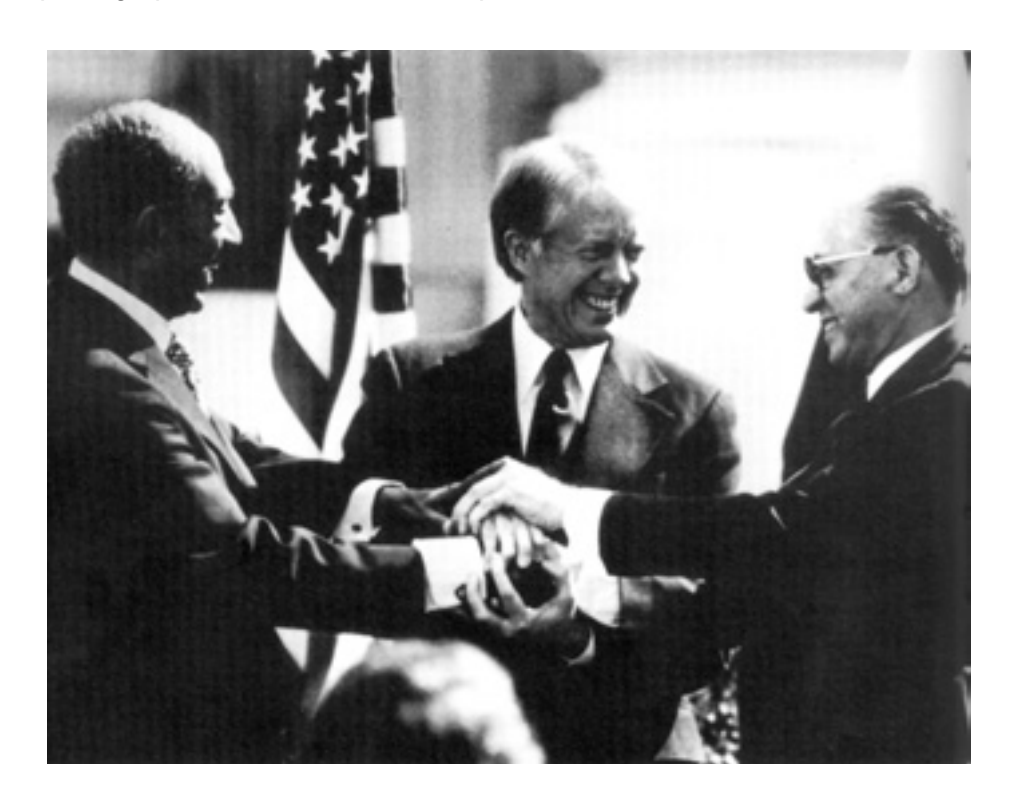
Begin, Sadat and US President Carter celebrate the peace treaty between Israel and Egypt, Washington DC, 16 March 1979.